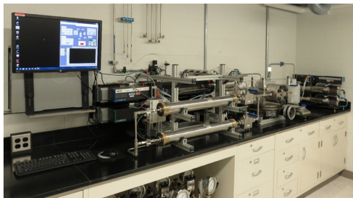
Figure 1. Borehole Simulator Apparatus.

This work advances the DOE/FE/NETL mission of ensuring the safe, efficient, and economic use of our fossil energy resources. Because of the project, the public will benefit from advances in the science-base for understanding well system barrier performance, open-source tools that stakeholders can use to simulate key processes that affect offshore well integrity, and innovative materials that can be used to reduce the risk of well integrity loss in the barrier system.